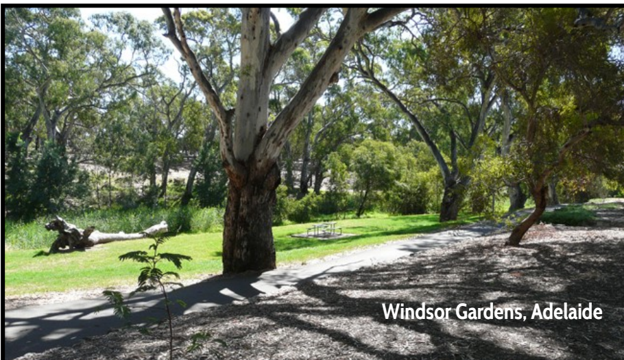
Windsor Gardens, Adelaide

No clergy, no hymns, no prayers, no crosses . . . that was Adelaide's first humanist wedding on Sunday.