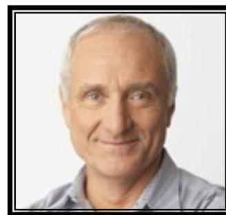
Robyn Williams AM

Chosen as Humanist of the Year in 1993, talented actor, science journalist and broadcaster Robyn presents Radio National's Science Show and Ockham's Razor. Robyn Williams has written more than 10 books and received Honorary Doctorates in Science from Sydney, Macquarie and Deakin Universities.