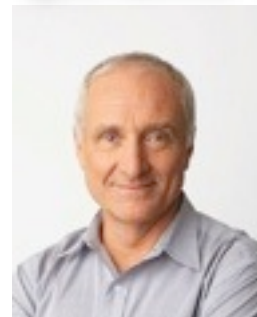
Robyn Williams AM

Humanist of the Year 1993, Member of the Order of Australia 1988, a talented actor, science journalist and broadcaster, Robyn, presents Radio National's Science Show, Ockham's Razor and In Conversation. Robyn has written more than 10 books and received an Honorary Doctorate in Science from the Universities of Sydney, Macquarie and Deakin.